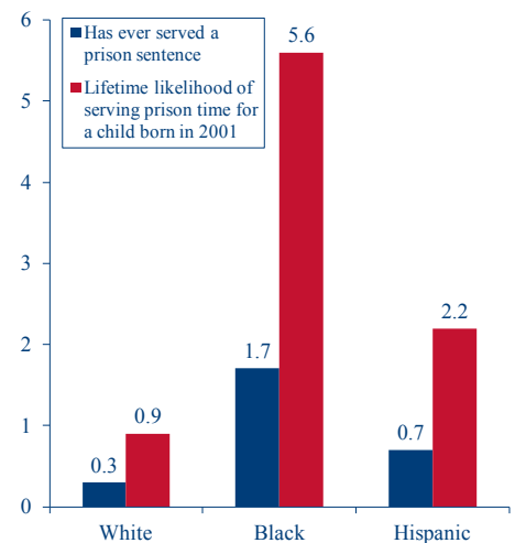
Figure 2: Percentage of U.S. Adult Women That Have Ever Been Incarcerated in a State or Federal Prison and the Lifetime Likelihood of Going to Prison for a Female Child Born in 2001