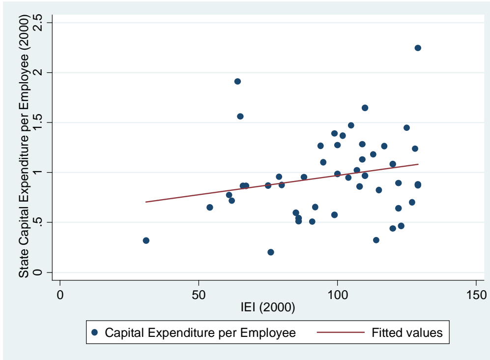
Figure 2 State Capital Expenditure per Employee and IEI (2000)

NOTE: Capital expenditure measured in thousands of 2000 US$. SOURCE: Chirinko and Wilson (2009); Patrick (2014a).